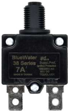
38-xx-####-P00NB1 *x indicates amp rating *# Indicates part option

Max Voltage: 32VDC Available Amps: 20, 30, 40, 50, 60A