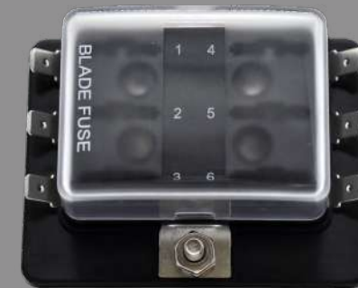
3200-100-006 6 Position