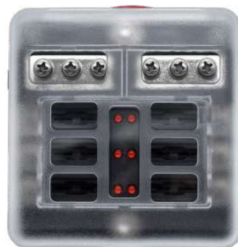
3200-0001-006 6 Position

Great For: Reliable Circuit Protection, Simplifying Wiring, And Safely Handling 100a To 250a With Breakers And Fuses.