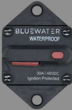
77000-9600-xxx *xx indicates amp rating