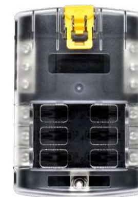
3200-3003-006 6 Position

Max Voltage: 48VDC Current Rating: 100A (6p) / 200A (12p)