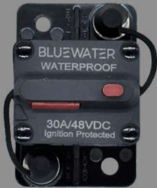
77000-9900-xxx *xx indicates amp rating

Max Voltage: 32VDC/48VDC Available Amps: 30 - 150A MOQ: 20