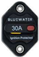
Panel Mount 78000-9600-xx *xx indicates amp rating Options listed below

Great For: Reliable Circuit Protection, Simplifying Wiring, And Safely Handling 3A To 250A With Secure Connections.