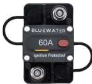
Surface Mount 78000-9900-xx *xx indicates amp rating Options listed below