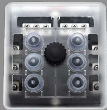
3200-2001-006 6 Position